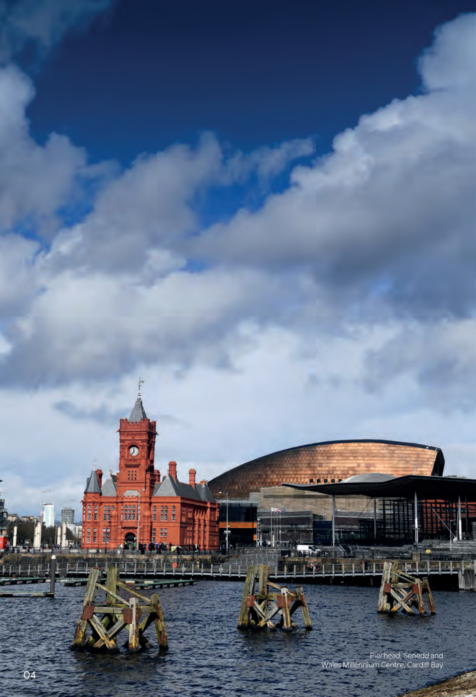
Pierhead, Senedd and Wales Millennium Centre, Cardiff Bay