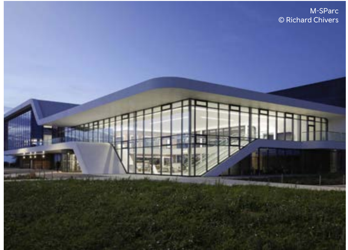
M-SParc

M-SParc can provide space for businesses of all sizes, from start-ups to large corporate companies. Everything a business requires, from outstanding facilities and bespoke business support services, which includes office space, laboratories, hot desking and virtual tenancies.